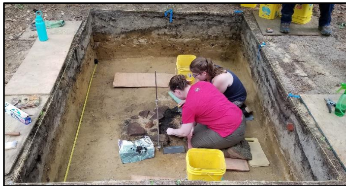
Excavation of a pre-contact Early Woodland period hearth feature at Livermore Falls State Forest, 2019

Session 2 will take place at Pillsbury State Park in the town of Washington, NH. Field school participants will engage in the survey of several areas exhibiting the potential to contain pre-contact deposits as well as continue to excavate a pre-contact