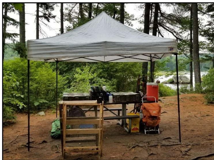
Field camp at Pillsbury State Park, 2019

archaeological deposit identified during the 2019 season. Work will focus on a former terrace of the Ashuelot River, located on the south side of Butterfield Pond in Pillsbury State Park. Archaeological survey and excavation techniques including artifact identification and excavation documentation will be taught. The field camp will be based at the Pillsbury State Park campground and primitive camping (i.e., no showers/electricity) will be available at no cost to participants. Canoes will be used to access the field camp and work area.