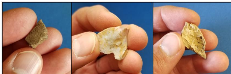
Pre-contact ceramic, lithic, and faunal artifacts excavated at Bear Brook State Park, 2019

Individuals may participate as SCRAP volunteers. There is no fee for participation as a volunteer; however we request a $40 donation to defray costs of supplies and instructional materials. Volunteers will receive the same instruction as credit students. Successful completion of the fieldwork will earn SCRAP certification for Survey and Excavation Technician status.